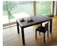
The story of Astor