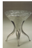
Octopus in aluminium